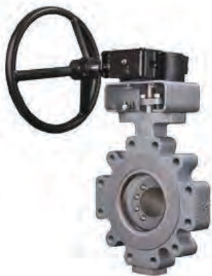
The WKM triple offset valve is a smaller, lighter valve that is easily installed next to a tank.

In addition to our valve solutions for tank storage isolation, our portfolio of power actuation technologies includes the LEDEEN* pneumatic and electric actuators. The consistent engineering design and efficient modular assembly allows increased operational flexibility to be achieved.